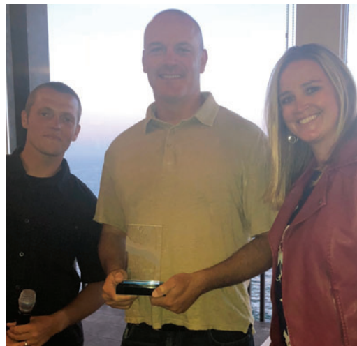
In 2018, Sage Ecological Landscape's Kriet Residence received the Medium Residential Landscape Award.