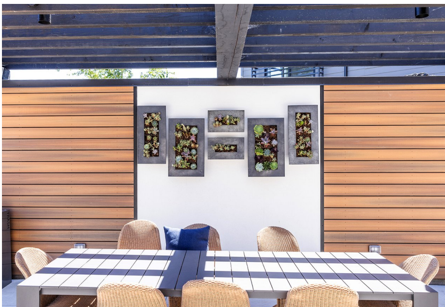
2022 Small Commercial Maintenance Award, Landscape Development, Inc.