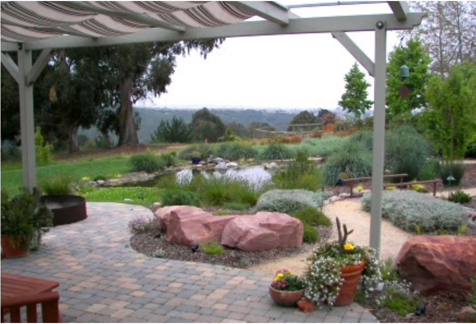
Residential project installed by Rock Solid Concepts.